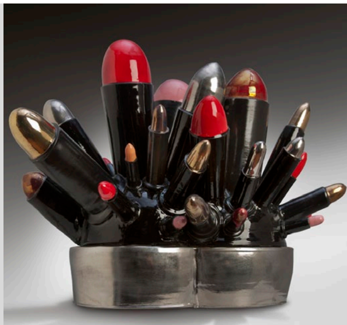
Facing page: I Don't Want a Bullet to Kiss Your Heart (Detail) . Border: Love and War: The Ammunition III . Ceramic, glaze, china paint, lustres. Sizes vary.