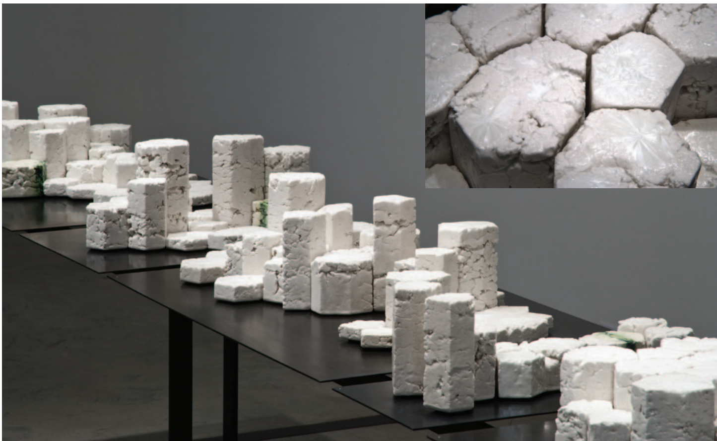
Above and inset: Topo 1–7 . 2010. Glazed fritware and steel. 29 x 178 x 26 in. Collection of el dorado architects, Kansas City, Missouri.

artist's body of work so fascinating and consistent is that its intention is unswerving, iterated and reiterated through successions of modified formal presentations that each delve ever deeper into complex conceptual evocations.